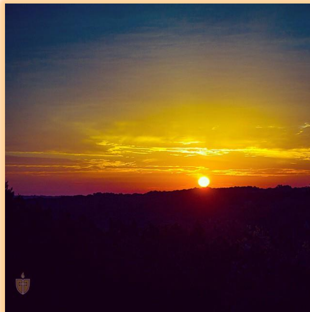
Sunrise at Concordia